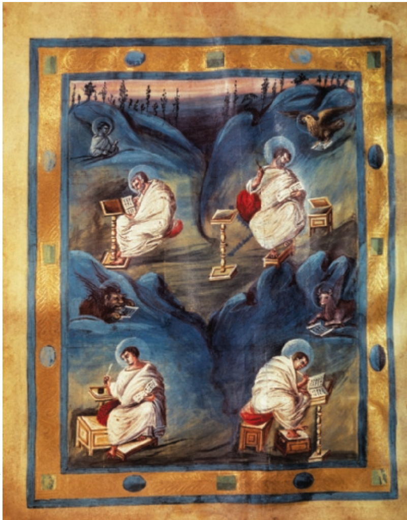
I-8 The four evangelists, folio 14 verso of the Aachen Gospels , ca. 810. Ink and tempera on vellum, 1' × 9 1/2". Domschatzkammer, Aachen.

Throughout the history of art, artists have used personifications —abstract ideas codified in human form. Because of the fame of the colossal statue set up in New York City’s harbor in 1886, people everywhere visualize Liberty as a robed woman wearing a rayed crown and holding a torch. Four different personifications appear