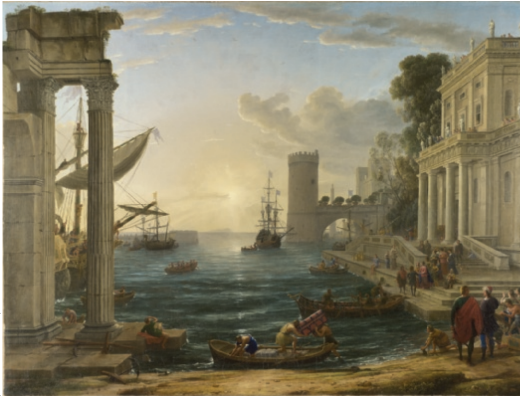
I-12 CLAUDE LORRAIN, Embarkation of the Queen of Sheba , 1648. Oil on canvas, 4' 10" × 6' 4". National Gallery, London.

To create the illusion of a deep landscape, Claude Lorrain employed perspective, reducing the size of and blurring the most distant forms. All diagonal lines converge on a single point.