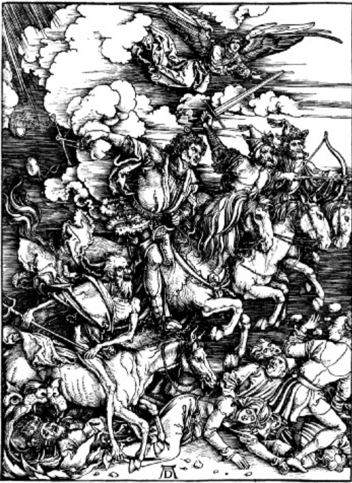
I-9 ALBRECHT DÜRER, The Four Horsemen of the Apocalypse , ca. 1498. Woodcut, 1' 3 1 / 4 " × 11". Metropolitan Museum of Art, New York (gift of Junius S. Morgan, 1919).

Personifications are abstract ideas codified in human form. Here, Albrecht Dürer represented Death, Famine, War, and Pestilence as four men on charging horses, each one carrying an identifying attribute.