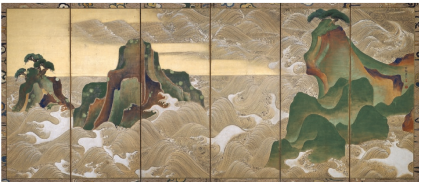
I-13 OGATA KORIN, Waves at Matsushima , Edo period, Japan, ca. 1700–1716. Six-panel folding screen, ink, colors, and gold leaf on paper, 4' 11 \frac{1}{8} " × 12' 7 \frac{7}{8} ". Museum of Fine Arts, Boston (Fenollosa-Weld Collection).

less concerned with locating the boulders and waves and clouds in space than with composing shapes on a surface, playing the swelling curves of waves and clouds against the jagged contours of the rocks. Neither the French nor the Japanese painting can be said to project “correctly” what viewers “in fact” see. One painting is not a “better” picture of the world than the other. The European and Asian artists simply approached the problem of picture making differently.