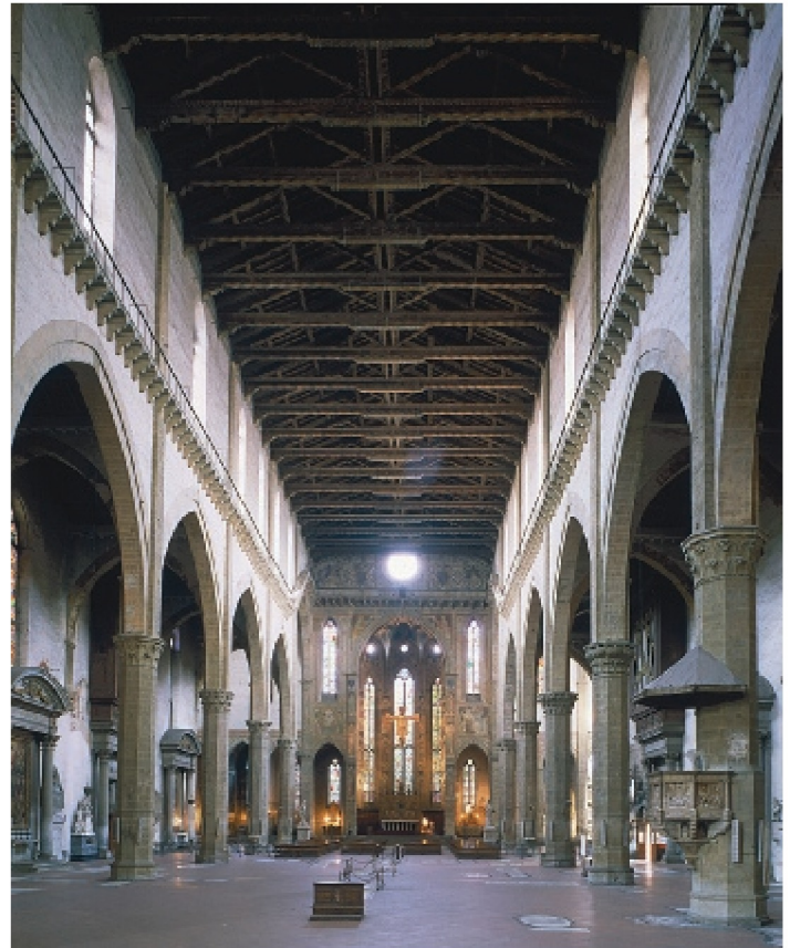
I-4 Interior of Santa Croce (looking east), Florence, Italy, begun 1294.

Period style refers to the characteristic artistic manner of a specific era or span of years, usually within a distinct culture, such as