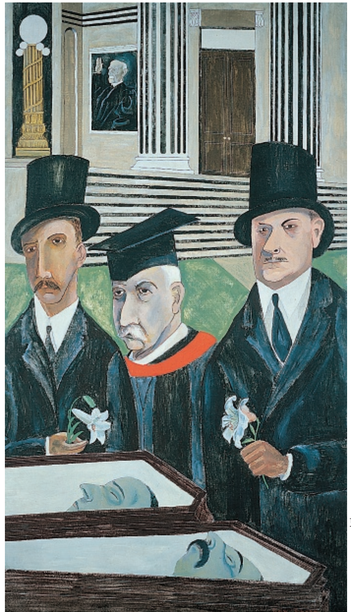
I-6 BEN SHAHN, The Passion of Sacco and Vanzetti , 1931–1932. Tempera on canvas, 7' \frac{1}{2} " × 4'. Whitney Museum of American Art, New York (gift of Edith and Milton Lowenthal in memory of Juliana Force).

Personal style , the distinctive manner of individual artists or architects, often decisively explains stylistic discrepancies among paintings, sculptures, and buildings of the same time and place. For example, in 1930, American painter GEORGIA O'KEEFFE (1887–1986) produced a series of paintings of flowering plants. One of them— Jack-in-the-Pulpit No. 4 (FIG. I-5)—is a sharply focused close-up view of petals and leaves. O'Keeffe captured the growing plant's slow, controlled motion while converting the plant into a powerful abstract composition of lines, forms, and colors (see the discussion of art historical vocabulary in the next section). Only a year later, another American artist, BEN SHAHN (1898–1969), painted The Passion of Sacco and Vanzetti (FIG. I-6), a stinging commentary on social injustice inspired by the trial and execution of two Italian anarchists, Nicola Sacco and Bartolomeo Vanzetti. Many people believed that Sacco and Vanzetti had been unjustly convicted of killing two men in a robbery in 1920. Shahn's painting compresses time in a symbolic representation of the trial and its aftermath. The two executed men lie in their coffins. Presiding over them are the three members of the commission (headed by a college president