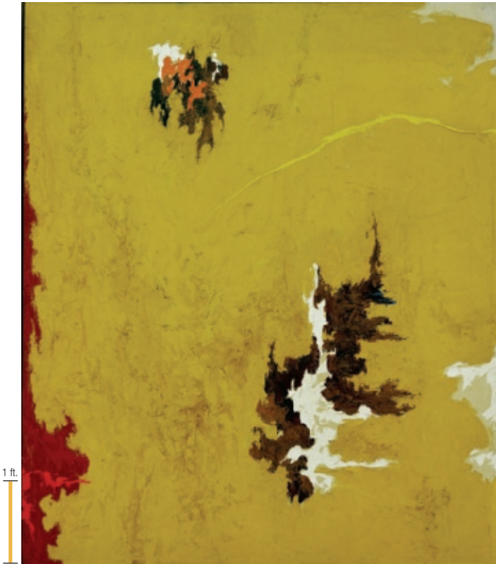
I-2 CLYFFORD STILL, 1948-C, 1948 . Oil on canvas, 6' 8 \frac{7}{8} " × 5' 8 \frac{3}{4} ". Hirshhorn Museum and Sculpture Garden, Smithsonian Institution, Washington, D.C. (purchased with funds of Joseph H. Hirshhorn, 1992).

Physical evidence often reliably indicates an object’s age. The material used for a statue or painting—bronze, plastic, or oil-based pigment, to name only a few—may not have been invented before a certain time, indicating the earliest possible date (the terminus post quem : Latin, “point after which”) that someone could have fashioned the work. Or artists may have ceased using certain materials—such as specific kinds of inks and papers for drawings—at a known time, providing the latest possible date (the terminus ante quem : Latin, “point before which”) for objects made of those materials. Sometimes the material (or the manufacturing technique) of an object or a building can establish a very precise date of production or construction. The study of tree rings, for instance, usually can determine within a narrow range the date of a wood statue or a timber roof beam.