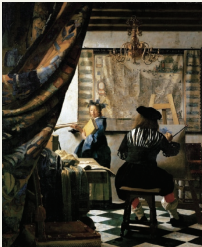
JOHANNES VERMEER, Allegory of the Art of Painting , 1670–1675. Oil on canvas, 4' 4" × 3' 8". Kunsthistorisches Museum, Vienna.