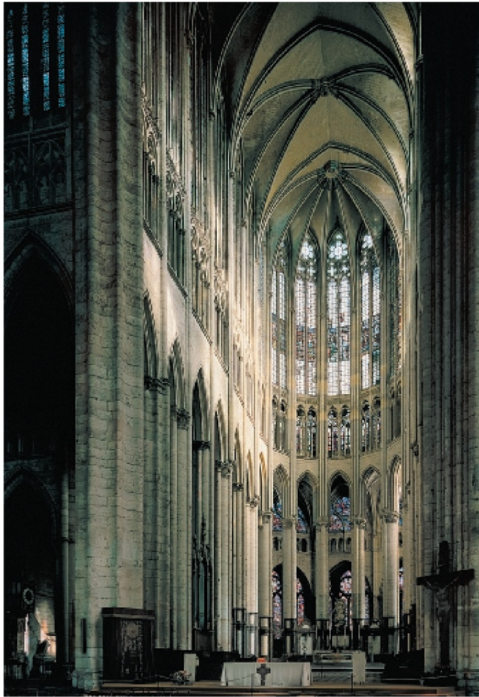
I-3 Choir of Beauvais Cathedral (looking east), Beauvais, France, rebuilt after 1284.

The style of an object or building often varies from region to region. This cathedral has towering stone vaults and large colored-glass windows typical of 13th-century French architecture.