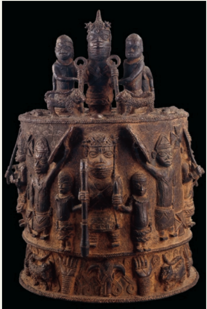
I-1 Altar to the Hand (ikegobo), from Benin, Nigeria, ca. 1735–1750. Bronze, 1' 5½" high. British Museum, London (gift of Sir William Ingram).

▲ I-1a Art historians seek to understand not only why artworks appear as they do but also why those works exist at all. Who paid this African artist to make this altar? Can the figures represented provide the answer?