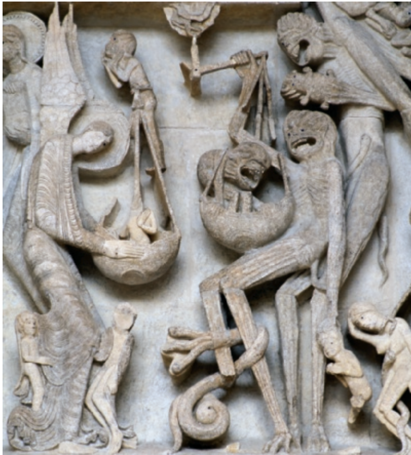
I-7 GISELBERTUS, weighing of souls, detail of Last Judgment (FIG. 12-1), west tympanum of Saint-Lazare, Autun, France, ca. 1120–1135.

In this high relief portraying the weighing of souls on Judgment Day, Gislebertus used disproportion and distortion to dehumanize the devilish figure yanking on the scales of justice.